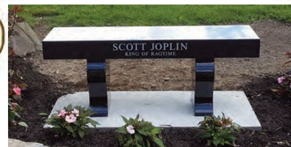
Scott Joplin was interred at St. Michael's Cemetery on April 5th 1917.