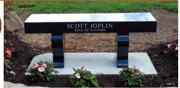
Scott Joplin was interred at St. Michael's Cemetery on April 5th 1917.

For 15 years the, annual Scott Joplin Memorial Concerts have been hosted by St. Michael's Cemetery, the composer's resting place. This year's concert will be held on May 18, 2 pm; rain or shine.